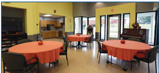
Spacious Dining and Activity Areas for Our Residents

Monsignor Bojnowski Manor believes in personalized services, our nurses, therapists, and certified nursing assistants get to know you on an individual level. Equally important - you get to know them. Our state-of-the-art Subacute Unit has private and semi-private rooms, Wi-Fi, flat screen televisions, among other amenities.