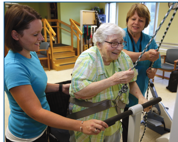
Our professional staff practicing everyday skills, with our residents, in preparation to go home

At Monsignor Bojnowski Manor, you and your physician can be assured that your rehabilitation is in the hands of some of the best professional caregivers in their field.