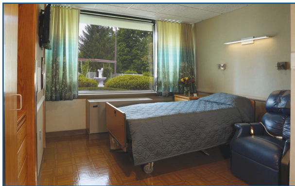
Newly Renovated Private/Semi-Private Rooms. Most Rooms have a View of Our Gardens.

Home assessments when needed, to ensure that you are ready to go home and your home is safe, adaptive and ready for you to return.